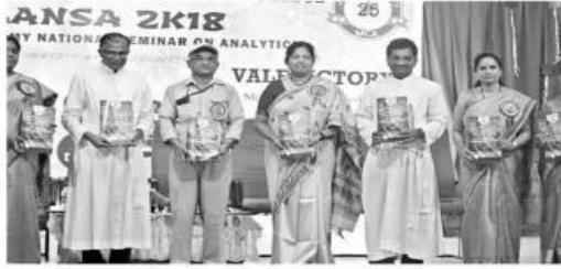
లయోలా జాతీయ సదస్సులో సావనీర్ను విడుదల చేస్తున్న ముఖ్య అతిథులు