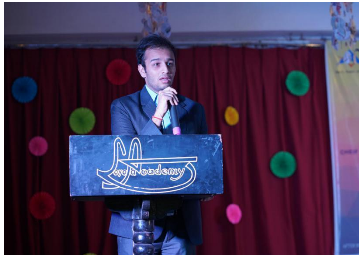
Cultural Activities, Timing: 10:45 to 11:20