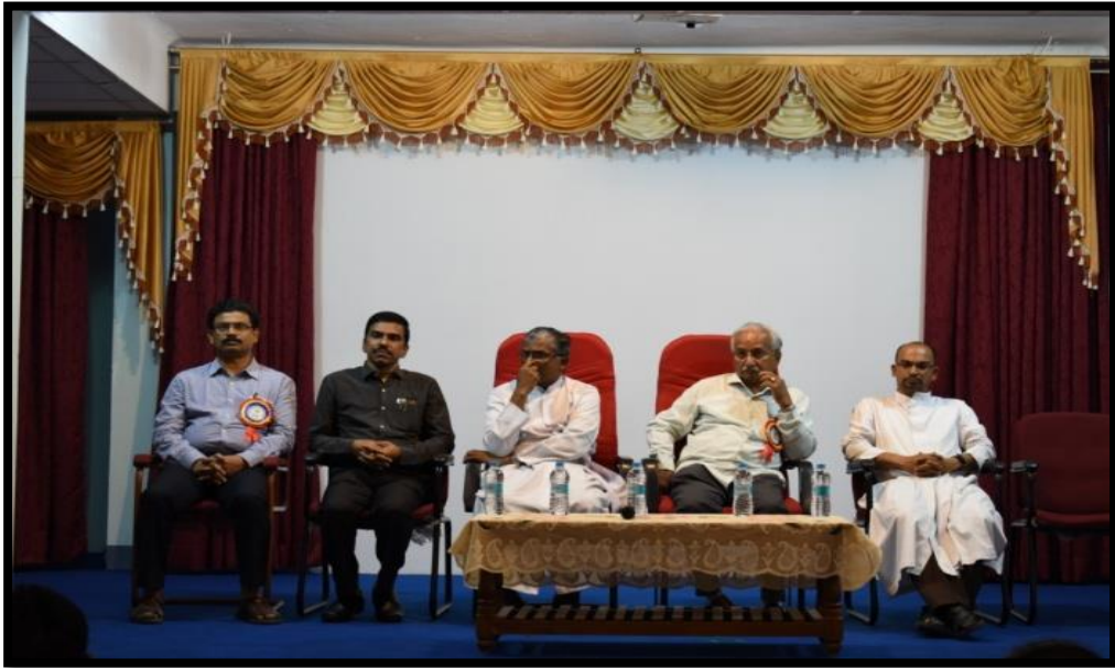
Inaugural Function of Math- Origins2018