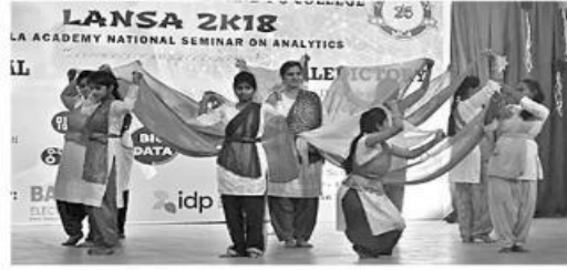
కళా ప్రదర్శనలు చేస్తున్న విద్యార్థులు

మనదేశంగాణ / ఆల్ఫాల్: లయోలాలో ఎన్నిక కోర్సును ప్రారంభించి 25 ఏళ్లు పూర్తయిన సందర్భంగా రజతోత్సవ వేడుకలను ఘనంగా నిర్వహించారు. లయోలాలో వ్యాపార విశ్లేషణ (బిజినెస్ అనాలటిక్స్) అనే అంశంపై రెండురోజుల జాతీయ సదస్సును ఎంసీఎ, ఎంబీఎ