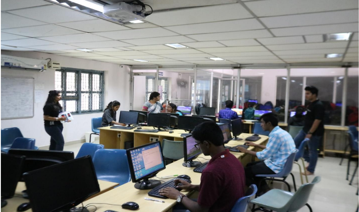
EVENT: TALENT SHOWCASE