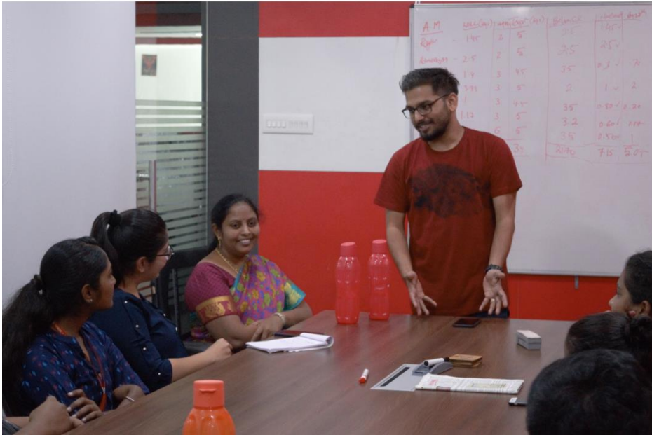
TV 5 Studio