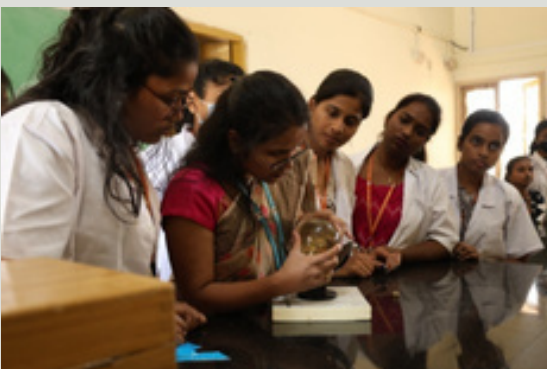
AGRONOMY LAB EXPERIMENT

Students gain theoretical as well as practical knowledge on areas like Agricultural Crop Production, Crop Protection, Agricultural Economics, Crop Improvement, Agricultural Extension, Agricultural Engineering, Horticulture apart from common subjects like English and value education.