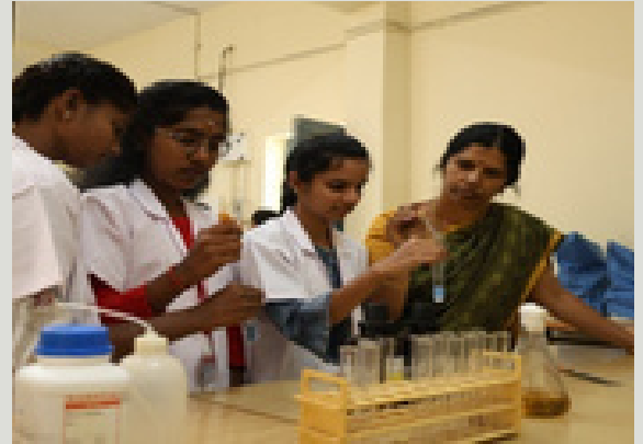
SOIL SCIENCE LAB EXPERIMENT