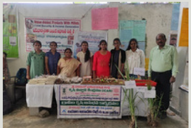
EXHIBITION AT KVK GADDIPALLY