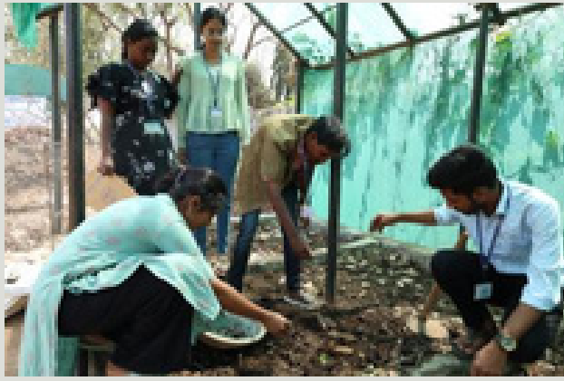
VERMI COMPOSTING AELP