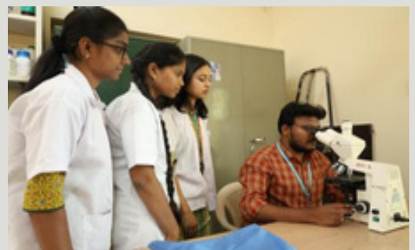
MICROBIOLOGY LAB EXPERIMENT