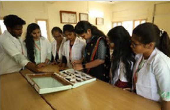
ENTOMOLOGY LAB EXPERIMENT