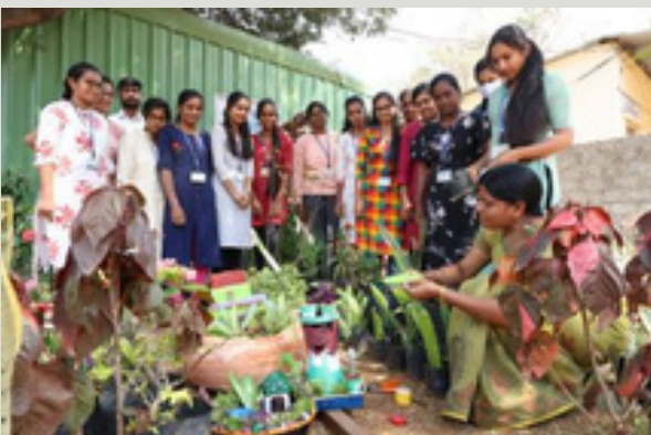
NURSERY MANAGEMENT AELP