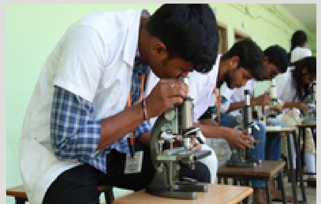
PLANT PATHOLOGY LAB EXPERIMENT