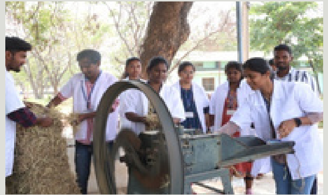
MUSHROOM CULTIVATION AELP