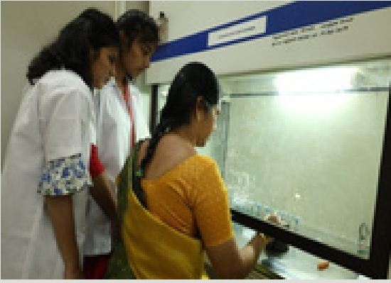
GENETICS LAB EXPERIMENT