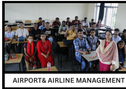
AIRPORT & AIRLINE MANAGEMENT