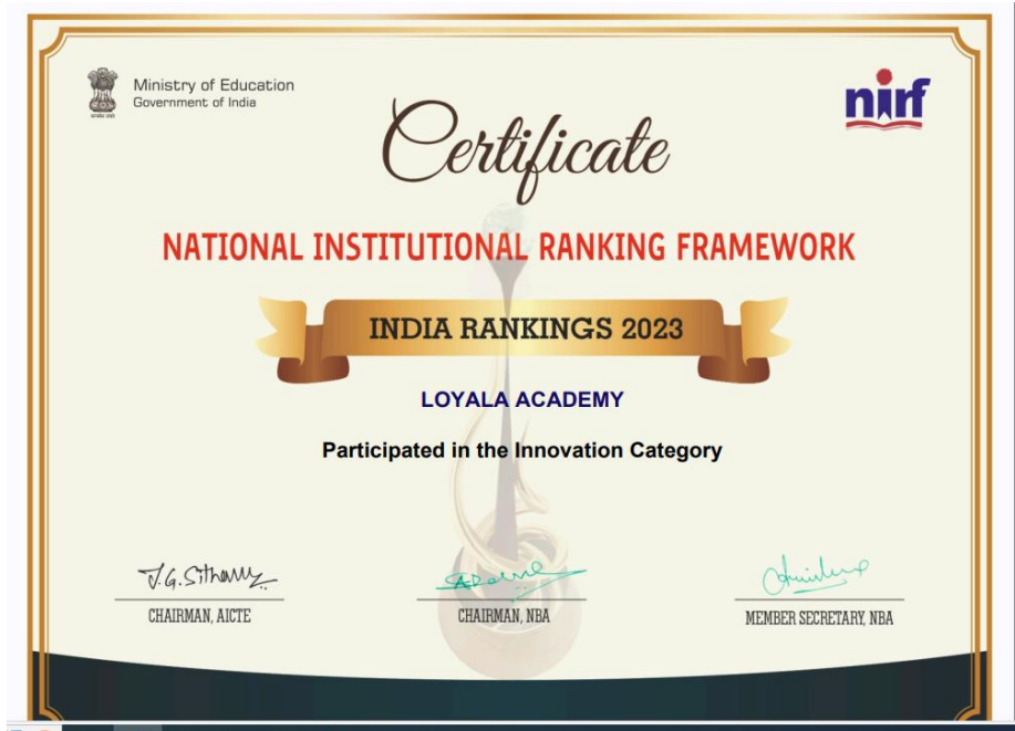
ARIIA Participation certificate

The College has participated in ARIIA ranking.