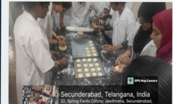
Earn While You Learn Programme