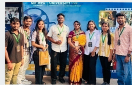
International Conference – PUNE