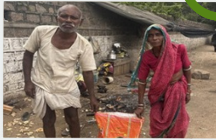
World Food Day