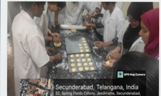
Earn While You Learn Programme