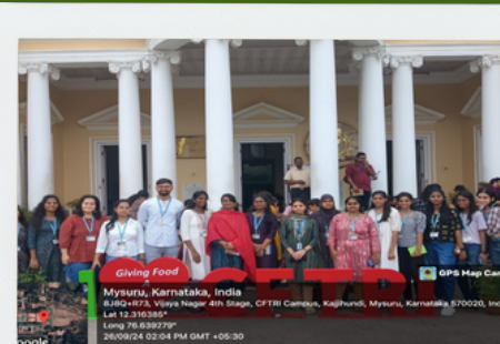
CFTRI – MYSORE