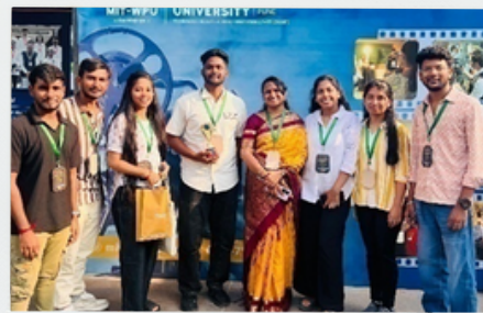
International Conference – PUNE