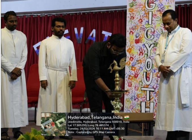
Hyderabad, Telangana, India Jeedimetla, Hyderabad, Telangana 500010, India Lat 17.505293, Long 78.485374 Tuesday, 24/02/2026 10:11 AM GMT+05:30