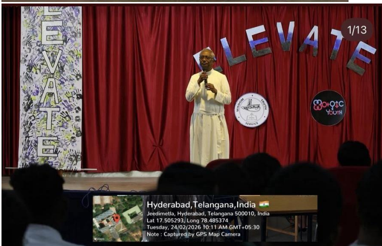
Hyderabad, Telangana, India Jeedimetla, Hyderabad, Telangana 500010, India Lat 17.505293, Long 78.485374 Tuesday, 24/02/2026 10:11 AM GMT+05:30 Note: Captured by GPS Map Camera