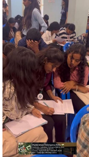
Hyderabad, Telangana, India Jeedimetla, Hyderabad, Telangana 500010, India Lat 17.505293, Long 78.485374 Tuesday, 24/02/2026 10:11 AM GMT+05:30